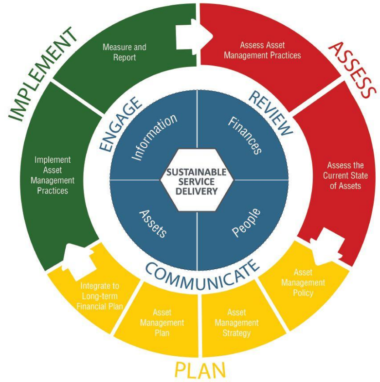
AMBC Cycle (The How)