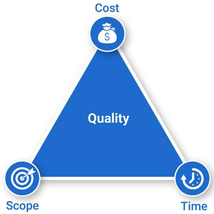
Project Management Triangle