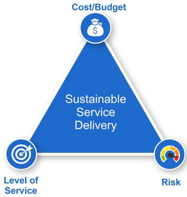
AM Triangle (The What)